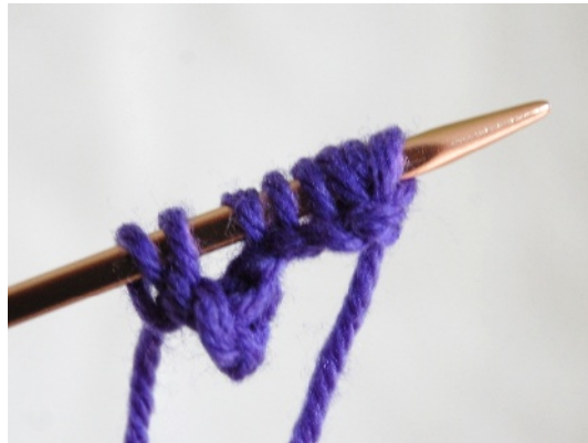
4. Repeat steps 1 to 3 until desired no. of sts have been cast on. It's a good idea to end with a cast-on of 2 after the last picot to balance the stitches.