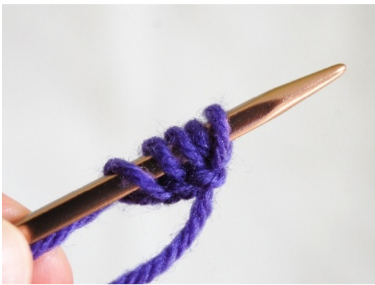
1. Using cable cast-on method, cast on 5sts.

Based on the cable cast-on the number of stitches cast-on can be varied, depending on how much space between each picot you prefer and how small or large you like your picots. You could use a knitted cast-on instead of a cable cast-on for a lacier effect.