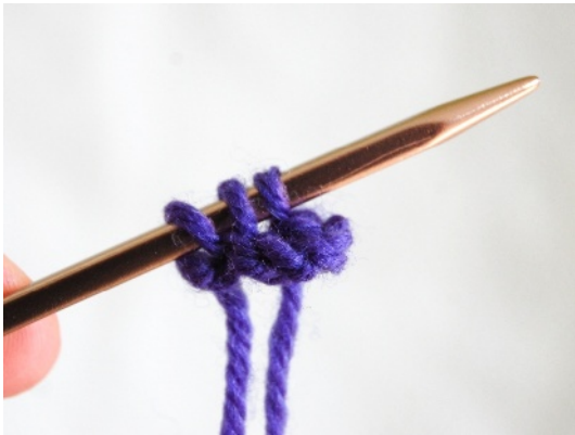
3. Pass the stitch on the right hand needle back to the left hand needle – 3 sts cast on.